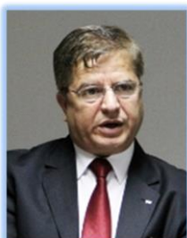
Dr. Jawad Awwad Minister of Health, Palestine