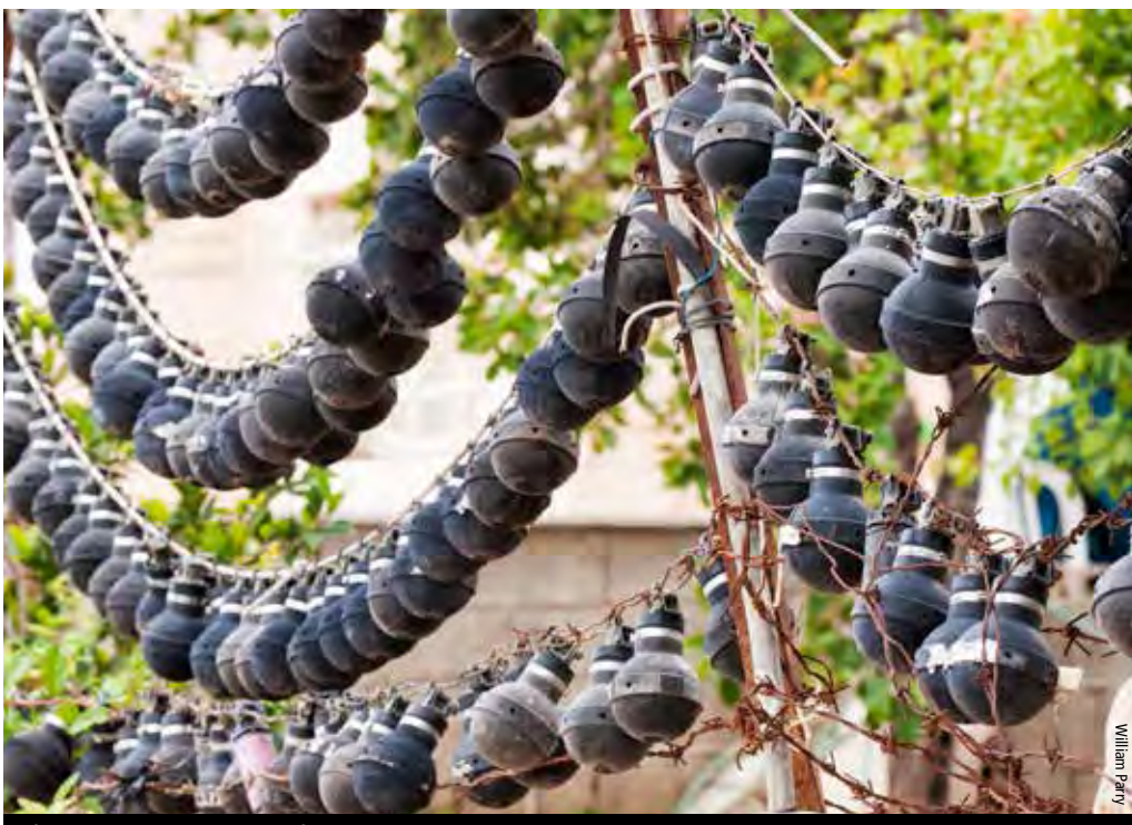
A family decorates the outside of its home with spent teargas canisters in Al Nabi Saleh

Over the past year, our teams in the Middle East have been working in increasingly demanding conditions, faced with a growing refugee crisis in Lebanon and mounting tensions in occupied Palestine. We have responded to the immediate needs of those worst affected by occupation and displacement, whilst also supporting long-term health development by strengthening the resources of the Palestinian communities we serve.