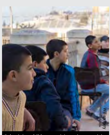
Palestinian children participate in an activity at Saraya Centre, Old City, Jerusalem

Psychosocial support is an integral part of MAP's work. It helps individuals and communities to heal psychological wounds and strengthen individual and community resilience. MAP's work helps to support Palestinians in their determination to be active survivors rather than passive victims after suffering years of conflict, human rights violations, displacement, military occupation and blockade.