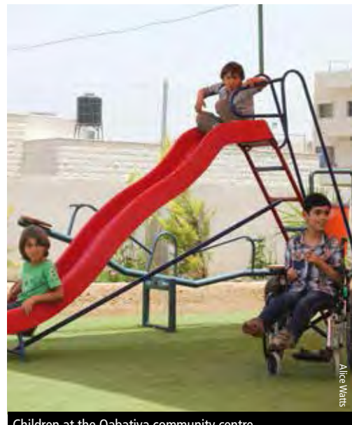
Children at the Qabatiya community centre

In addition, a community gathering room will be constructed and furnished for parents and other community members to sit and talk in a friendly and informal space. In Qabatiya, the community room allows women to relax in a private space and many of the mothers have commented that having this shared area has led to a much stronger relationship between them, providing them with invaluable peer support.