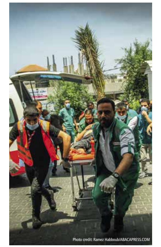
The arrival of injuries to the Indonesian hospital as a result of raids launched by the Israeli warplanes targeting the homes of citizens in the city of Beit Lahia, north of Gaza, May 12, 2021

At the end of a day when you have done 14 to 16 hours of operating in Gaza, you're left with a complete and utter sense of sadness about the lives that you have seen that have been destroyed. When you see these injuries and know that these limbs and bodies have been broken, you know that this has also shattered people's lives. Their lives will never be the same again."