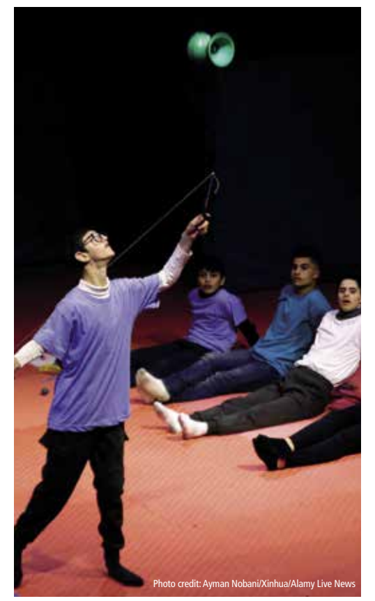
Young students from Palestinian Circus School perform together with peers with learning disabilities. The performance was the first of its kind, which came after almost three months of training and preparations.

We face restrictions on freedom of movement. We are not able to provide our training for children or the youth in Jerusalem, especially in these difficult times where children are exposed to excessive use of force and forced expulsion from their homes.